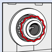
FLEX Socket – With 30° lock for angled outlet – Anti-twist tooth system