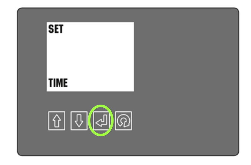
Diagram 2 required (normal display ) check manual