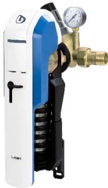
BWT E1 HydroMODUL

Current version February 2021 Technical subject to modifications.